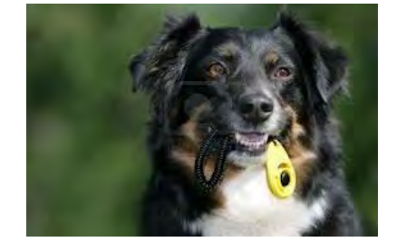
Issue SC043-50Y053 August-September 2020