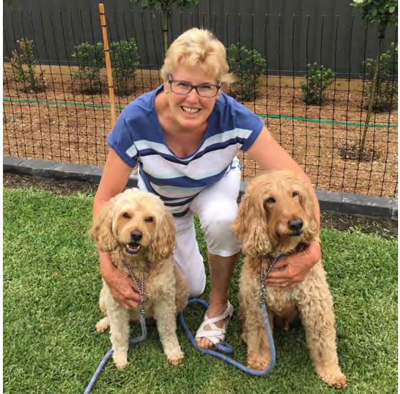
Issue SC043-50Y053 August-September 2020

Since poodle cross dogs have coats similar to wool, it must be kept trimmed (especially in Summer), to avoid overheating and matting. I do not clip my puppies until around 5 - 6 months of age, depending on the weather conditions. Puppy coats generally do not require clipping before this age, provided you do not allow knots to form. Most professional groomers will shave your dog if you bring him in with a heavily matted coat. It is too painful for the dog and they simply do not have the time to painstakingly remove all knots (it can take hours believe me I know!!).