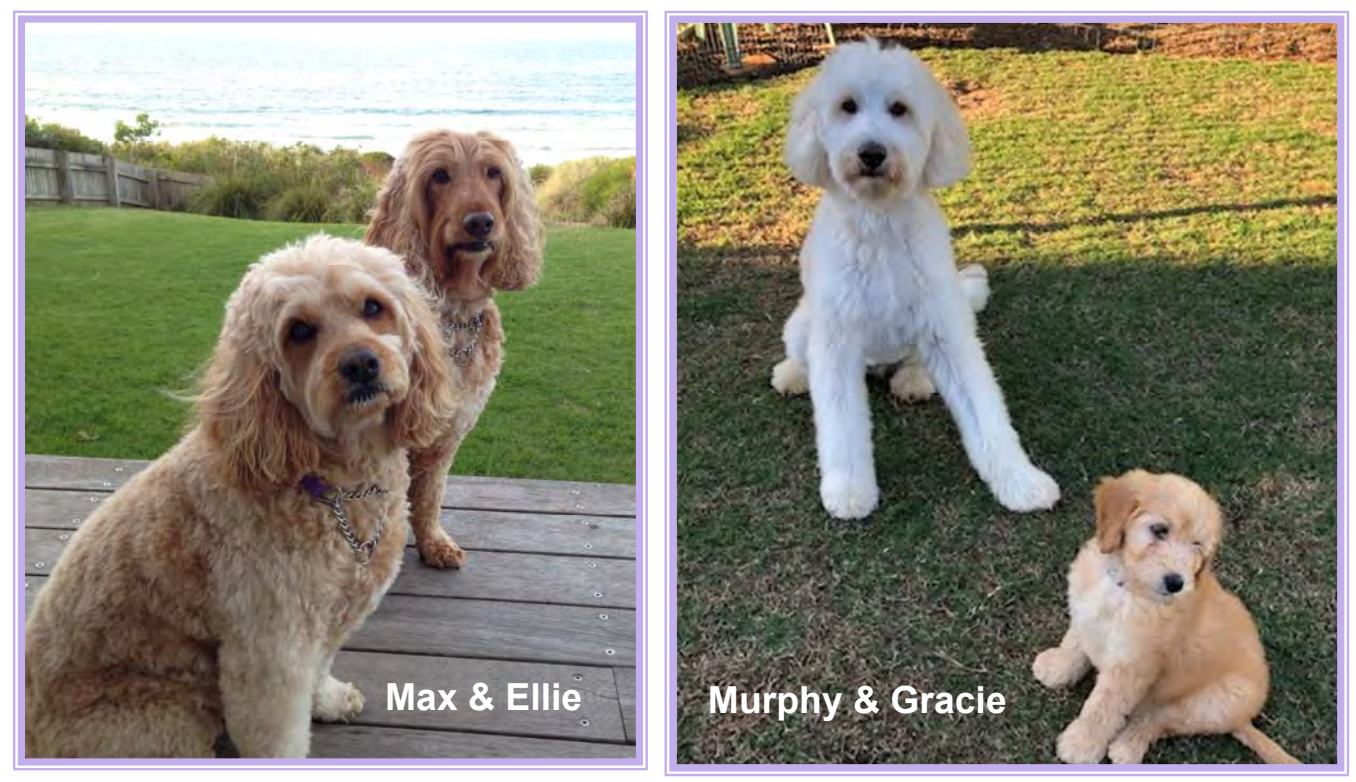
Issue SC043-50Y053 August-September 2020

(Deputy Chief Instructor - Sutherland Shire Dog Training Club).